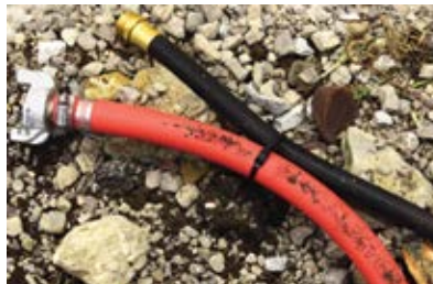
Zip tie or strap hoses together