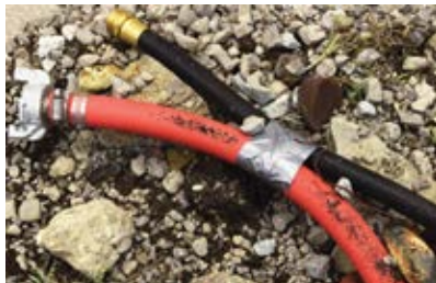
Tape hoses together